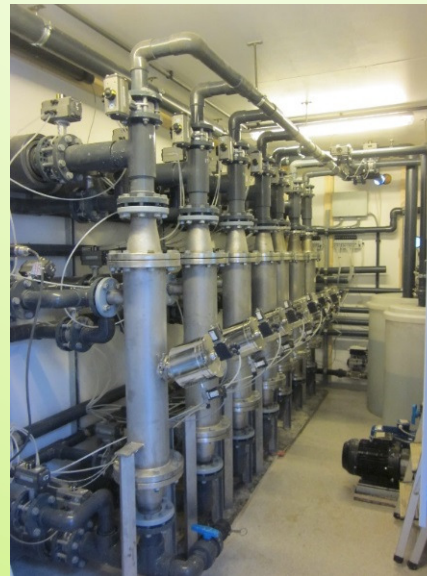
PURUF® treating PURROT® -Filtrate.