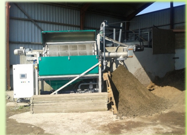
PURROT® at a pig farm with Manure.