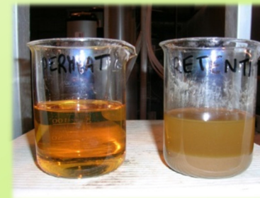
Permeate and Retentate from PURUF®